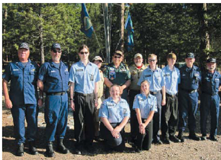
Photo above - USCG and Flags Crew. Photo below - Lucy M Crew Tidying.

For further information interested parties are asked to contact Skipper